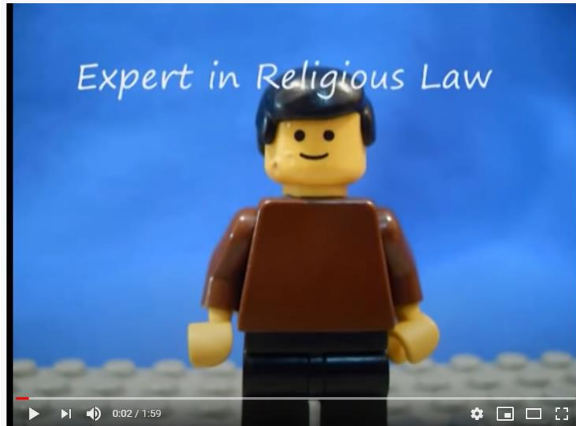
Lego Parable-The Good Samaritan

https://www.youtube.com/watch?v=L3GJCK4Wy-0