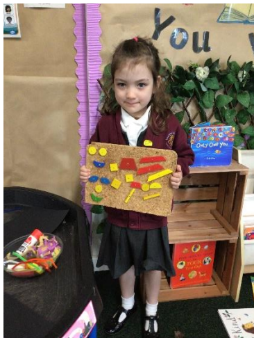
Some photos from this week in Reception

Next week, we will be learning about Diwali – the festival of light!